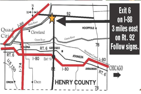
13451 IL Hwy 92 • Geneseo, IL 61254